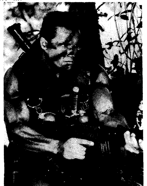
An Unidentified A-House Commando