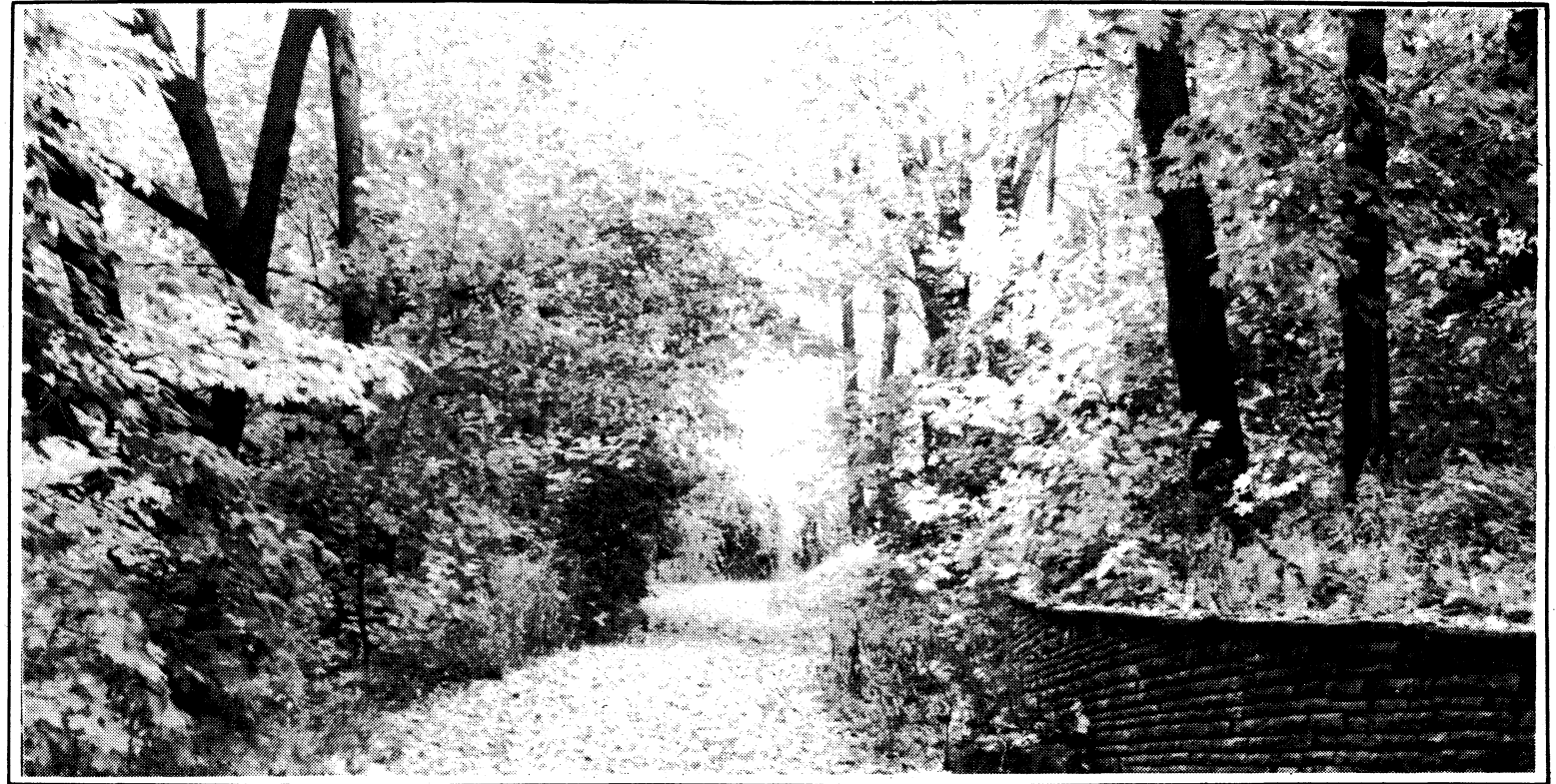
Compared to today, this photo of the early seventies, shows how the path behind Wood Residence has slowly lost its natural aspect.

Students and staff may have noticed bricks lying around on campus. People have been dumping bricks on the lower campus and this is being cleaned