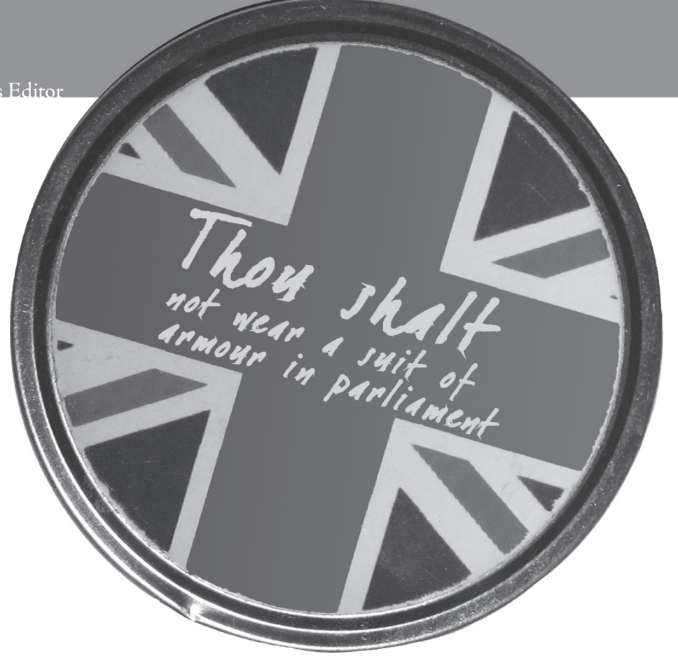
9. It is illegal to enter the Houses of Parliament in a suit of armour.

8. It is illegal to avoid telling the British Tax Man anything you do not want him to know, but it is legal to withhold anything you don't mind him knowing.