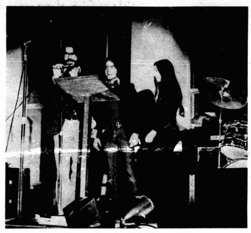
"I want to thank all those who made this possible."