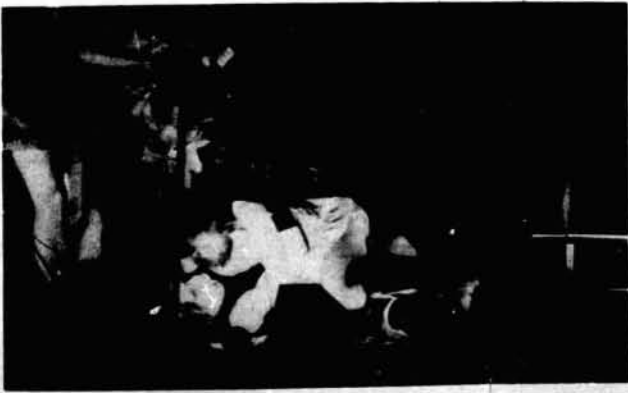
Streakers - eat your hearts out!