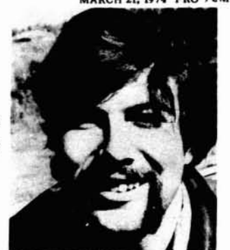
FACULTY COUNCIL - 18 to be

The referendum on whether to increase the student's allotment to OFS by $1.50 was easily passed and so Glendon joins a growing number of Ontario universities that have appro-