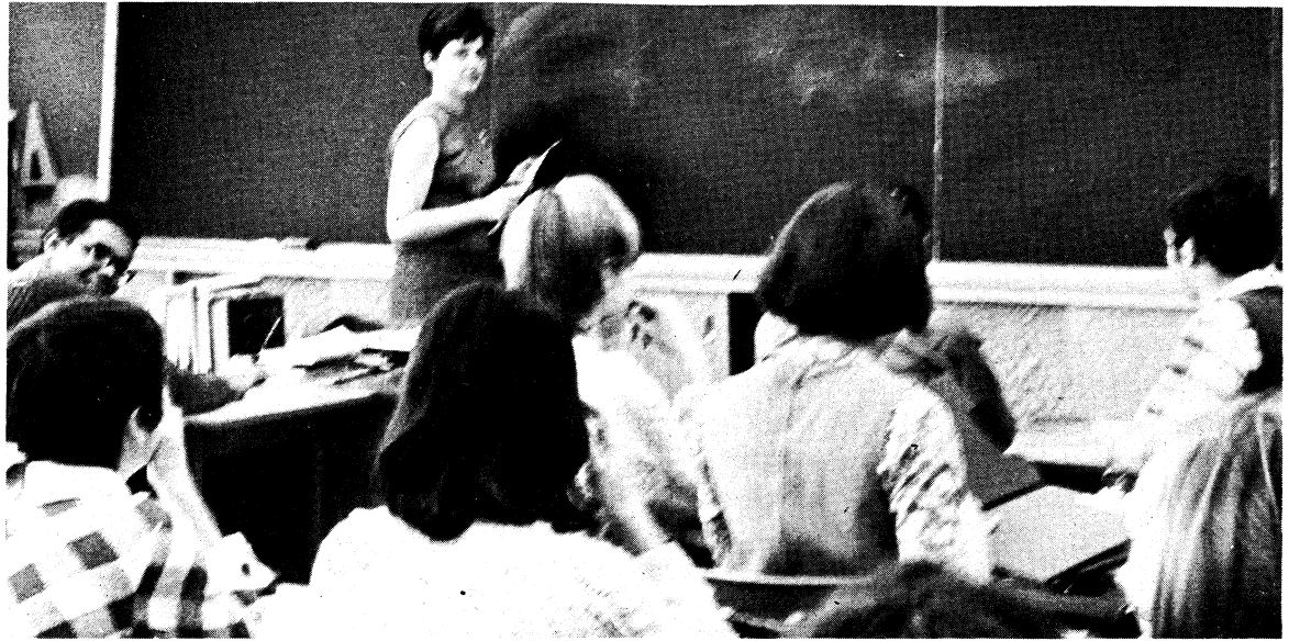
The OUS teach-in on Saturday will discuss the high school system.

A mass meeting is planned for Sunday at 1:00 at University College at U of T to discuss what action students can take in Toronto high schools.